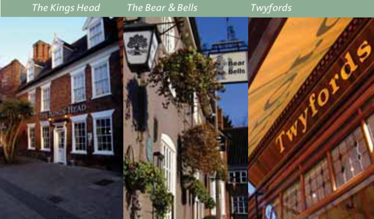
The Kings Head The Bear & Bells Twyfords