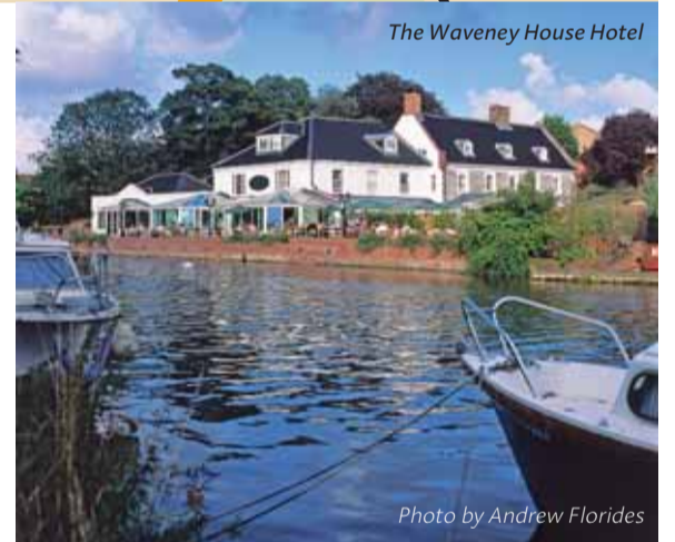
The Waveney House Hotel

Bartrums Pet Shop Beccles Jewellers Bookthrift Breeze - Fashion Chambers - Butchers Cloves Dress Agency Coes Menswear Coopers - Hardware Copperfields - Jewellers Country Cards Covent Garden - Fruit and Vegetables Cracks Pet Shop Daisy Roots - Gifts Fat Face Felix Shoe Menders & Key Cutting Focus 23 - Photography Fresh & Silk Flowers Furniture Affair Gary's Discount Gazette Bookshop Hughes Electrical Jodphurs - Saddlers Just Jumpers - Fashion Kulture Shock - Pop Culture Laura Ashley Lollipop - Childrens Shoes Michaels Cycles Opulence - Furniture & Fire Stoves Parish Lantern - Gifts Pink Lady - Childrens Clothes Play the Game - Console Games Quayside Conservatories R. Tilney - Gunsmith Sawdust - Fashion Simply Cards Smash Skates & Fashion Sweet Memories - Confectionery Taylor's Electrical The Nail Bar The Marmalade Tree - Gifts The Toy Box Westgate Co-op Store Willows - Gifts