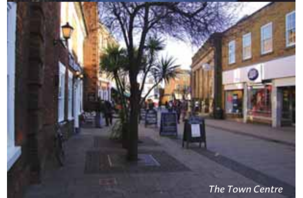
The Town Centre