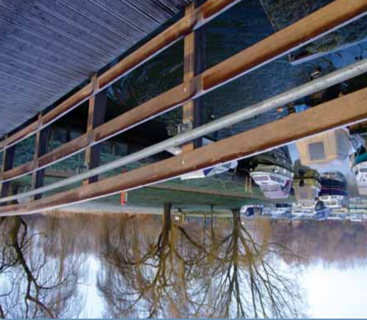
Above: Town Centre Below: Beccles Quay Big Dog Ferry

The town was also home to Catherine Suckling who was married in the town's St Michael's Church to Edward Nelson and later gave birth to England's greatest Naval Hero – Lord Horatio Nelson . Details on the history of Beccles can be found within the town's museum (open April to October, Tuesday to Saturday, 2.30pm to 5pm). One of the town's other historical landmarks is the Bell Tower . At 97 ft tall it stands detached from the main body of the church, offering spectacular views across the surrounding countryside. At different times of the year the Bell Tower is open for guided tours providing visitors with an insight to the building's history. The popular quayside area of the town is the Southern Gateway to the Broads National Park . This area is not only extremely popular with water users, but is also ideal for families, walkers and those interested in wildlife.