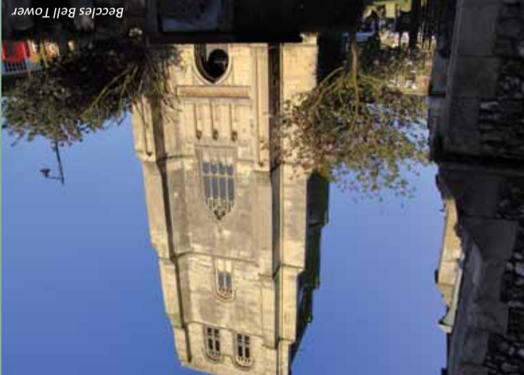
Beccles Bell Tower

WELCOME TO BECCLES Sited inland on the River Waveney, Beccles sits at the southern point of the Broads National Park.