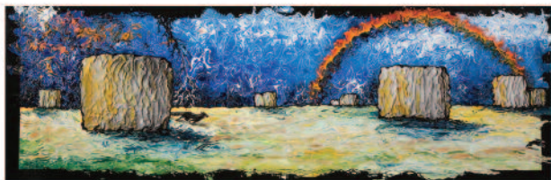
'Hay Bales' by Richard Wolsey

Exhibitions - Publications - Functions - Courses - Photography - Video